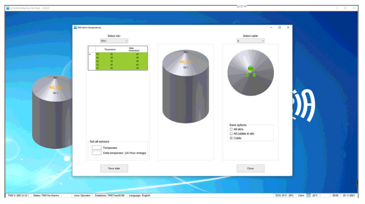
Display of alarm set and level